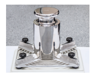
Positioners on an open-workweighing pan