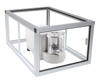
External anti-draft chamber