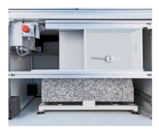
Stable construction of the table